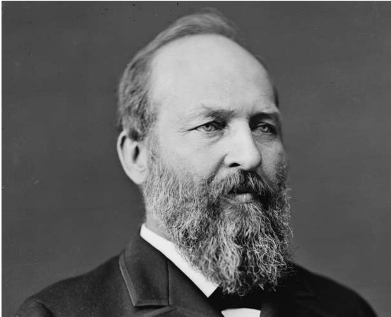
James A. Garfield